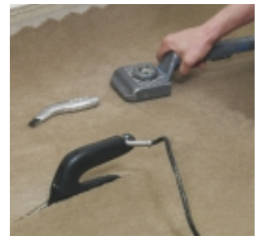
Typical tools for carpet seaming