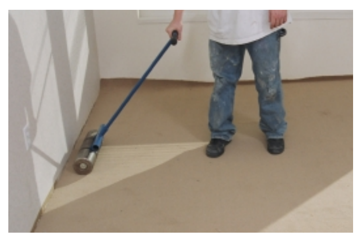
Roll in both directions to promote complete adhesion

Using an appropriate carpet roller, roll in both directions to promote complete adhesion of carpet to cushion. Rolling should be performed with the lightest roller that achieves proper transfer of the adhesive into the carpet back. Refer to manufacturer recommendation for