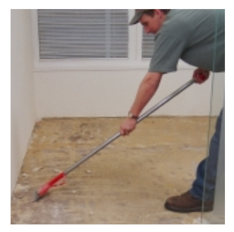
Start with a clean, dry, and smooth floor

The floor should be free of holes and loose tiles or boards. Repairs should be made as necessary to provide a smooth surface for carpet and cushion installation. The floor should be dry