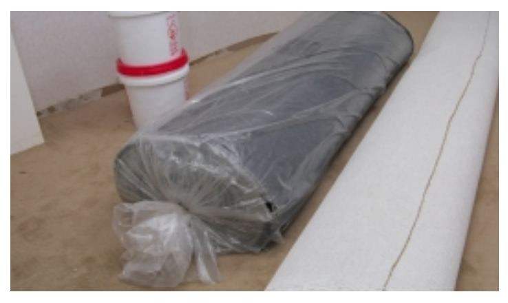
Acclimate materials for 48 hours prior to installation

The space in which the carpet is to be installed needs to have adequate temperature and humidity control to facilitate proper installation. Beginning 48 hours before the installation and continuing at least 72 hours following completion of the installation, the temperature needs to be maintained between 65° F. and 95° F. and the relative humidity between 10% and 65%. To achieve the best possible installation, according to The Carpet & Rug Institute's CRI 104 (2002), all materials should be acclimated 48 hours prior to installation. If installing over concrete, the slab temperature should not be less than 65° F. The completed installation needs to be maintained at a minimum of 55° F at all times.