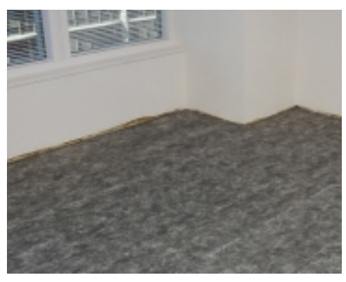
Cushion installation complete