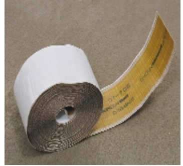
Use only hot melt seaming tape designed for double-glue installation