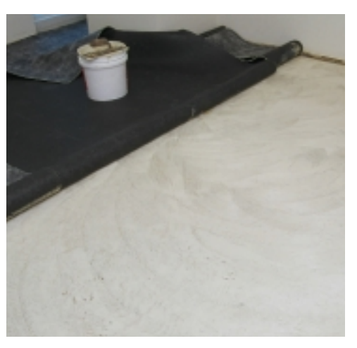
Proper open time is critical for a successful installation