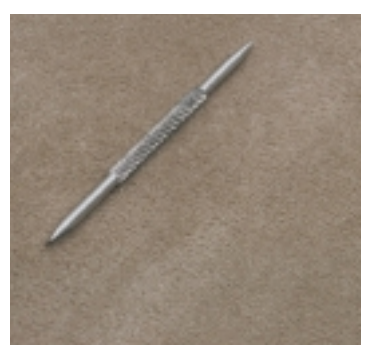
Finished seam (below tool) is nearly invisible

pattern repeat. Carpet seams should be at a right angle to cushion seams or offset at least 6 inches (150mm) to either side. Align all carpet breadths to their proper position and trim seams.