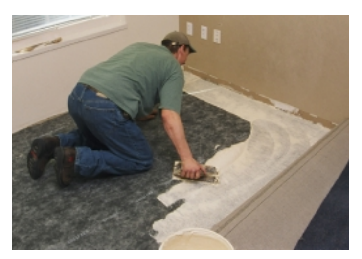
Apply adhesive to cushion following manufacturer's recommendations

Care must be taken to avoid cutting into the cushion under the seam.