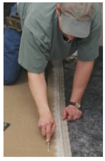
Dry-fit carpet according to layout plan

should be laid into the adhesive while in a "tacky wet" condition. For pressure sensitive adhesives, this point is often identified when the adhesive turns clear from its original opaque appearance. Smooth the cushion into the adhesive, working toward the seams. Trim in, eliminating any bubbles or wrinkles so the