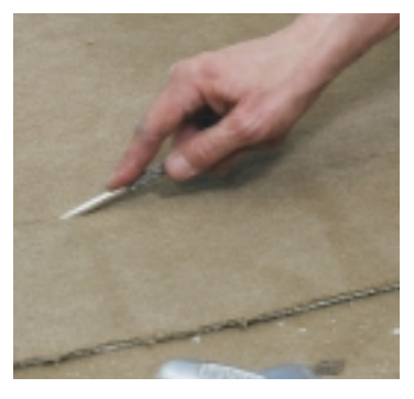
Use seaming technique appropriate for carpet type

After the cushion has been secured, cut the carpet to the proper length and spread out in the area to be carpeted. The carpet should be cut 3-4 inches (75-100 mm) longer than the area measurement. Where applicable, allow for