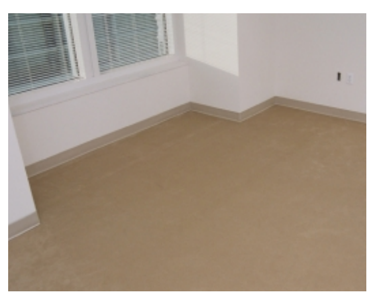
Prevent traffic over carpeted area for a minimum of 24 to 48 hours after installation

roller weight. Eliminate any bubbles by pressing straight down prior to full adhesive set up time. Do not roll bubbles to edge. Woven carpet should be rolled a second time about 3 to 12 hours after initial rolling to make sure a strong bond is established. Due to dimensional instability, double-glue installation of carpet with a unitary backing is typically not recommended. Prevent all traffic over carpeted area for a mini-