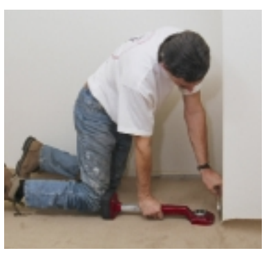
Install carpet and trim in

Once the adhesive has been spread for a given section, lay carpet into the adhesive according to the adhesive manufacturer's recommendation for open time so as to allow even distribution and penetration of adhesive on all areas of backing.