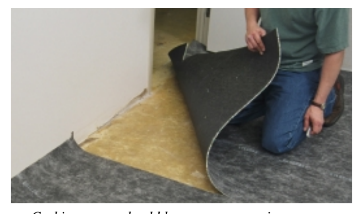
Cushion seams should have no compression or gaps

and dust-free. All contaminants that may prevent good adhesion need to be removed. Floors should be vacuumed, mopped if necessary, and otherwise thoroughly cleaned prior to carpet installation. Excessive use of water for cleaning is not recommended, though mopping with a slightly damp mop is useful to remove dust from the floor surface. Architectural tack strip, properly spaced and secured, may be used to hold the carpet edges in place. Setting cove base on top of carpet will also secure edges.